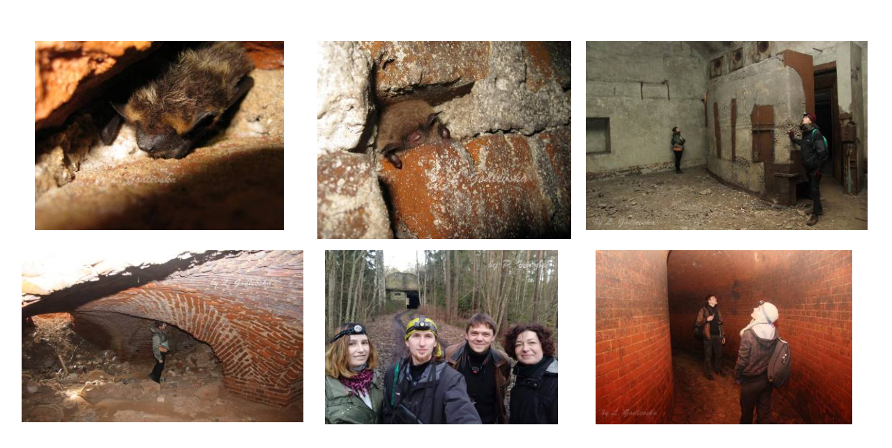
Symbolically, the census was done at the beginning of the Barbastelle's Year. The team found the important hibernacula of this species; the records allowed to clarify its range significantly.

During the winter field expedition, in the late February 2020, the team checked 27 determined to be perspective for bat hibernation objects from the "summer list" and additionally checked and explored 67 objects. Among the objects: basements and cellars of old manors and castles, crypts of abandoned churches, fortification and military buildings of 19th and 20th centuries. Six species were found hibernating in these sites: Myotis daubentonii, Myotis brandtii, Plecotus auritus, Barbastella barbastellus, Eptesicus nillsonii, and Eptesicus serotinus . The total counted (visible) number was over 1050 of specimens. However, the real number may exceed that in three times or even more. Buildings of abandoned Soviet missile bases revealed to be very important bat hibernacula.