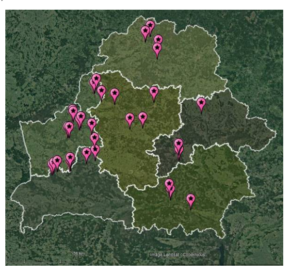
Study localities in winter, 2020

During the summer expedition, in June–July 2019, the team checked over 70 recognized distantly underground objects (basements of former manor houses and monasteries, cellars, ice cellars, old fortresses, crypts in churches, pillbox systems, etc.) in all six administrative provinces of Belarus (fig.). Each object was described by the common scheme. The standard approach of bat revealing was used. As well, convenience of examined sites for bat hibernation was estimated. All sites were examined for bats for the first time. Almost no bats were found in examined underground sites (only occurrence of P. auritus was confirmed for few of them). However, additionally, during the expedition the team did the survey of not troglophilous bat fauna using standard methods (distant observations with bat detectors, passing search of overground bat roosts, mist-netting out of underground sites).